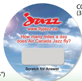
CO-SO2 (3.5" Diameter)