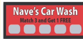
M-SO17 (4" x 1.75")