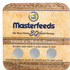
CO-SO1 (3.5" x 3.5")