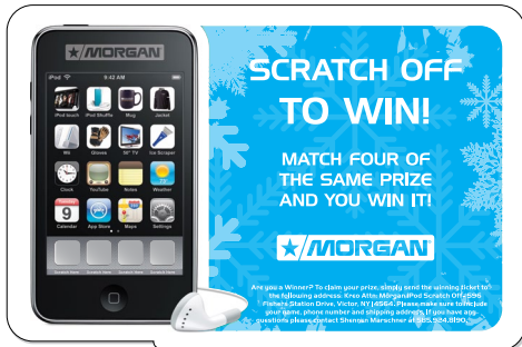
Postcard (7" x 5")