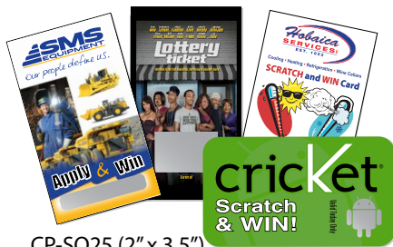
CP-SO25 (2" x 3.5")

Custom sizes are available for Scratch & Win orders. Please contact us for more information.