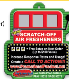
AF-SO95 (3.6" x 4")