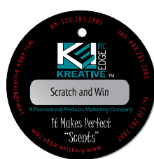
AF-SO31 (3" Diameter)