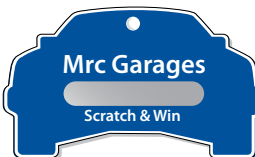
AF-SO67 (3.5" x 2")