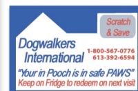
M-SO28 (3" x 2")