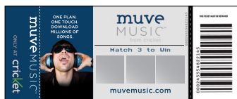
Postcard (5.5" x 2.25")