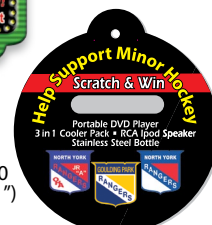
AF-SO110 (2.8" x 3.1")