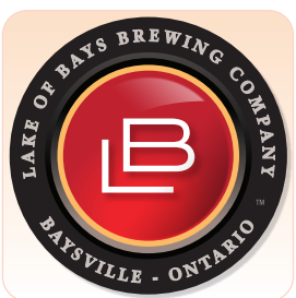
C8 (4" Diameter)