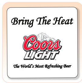
C2 (4" x 4")