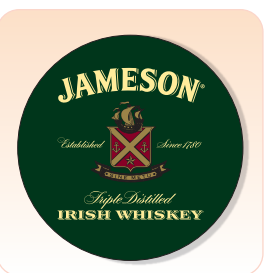
C5 (3.25" Diameter)