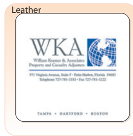
Leather LC01 (3.5" x 3.5") (Upgrade: Leather or Bonded Leather) See Leather Section for details