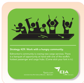
C1 (3.5" x 3.5")